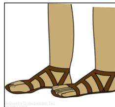
Two Left Feet

Two left feet? No problem! We will just pair you with someone with two right feet.